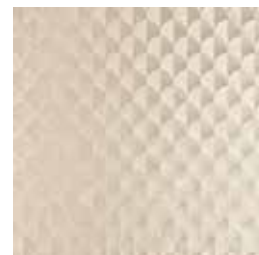
CLOCKWISE FROM BOTTOM RIGHT: 'Tea 5' pendant, Original BTC. 'Marmor' fabric (30069 007), Rubelli Venezia at Rubelli/Donghia. 'Scale' wallcovering (49101), Arte. 'Teddy' fabric (F2500017), mousse, Pierre Frey. 'Sing' fabric (30060/013), Rubelli Venezia at Rubelli/Donghia. 'Narina' wallcovering (109/10045), Cole & Son. 'Verdure' wallcovering (310431), tapestry green, Zoffany at Style Library